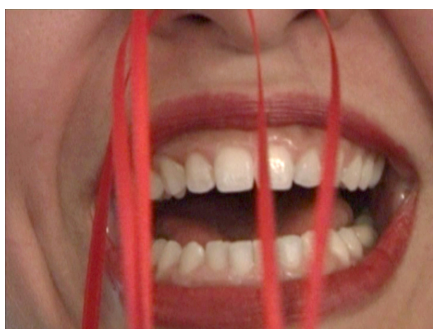
STURTEVANT Blow Job , (2006), videostill cam1

Private View: 22 nd January 2013, 18:00 – 20:30