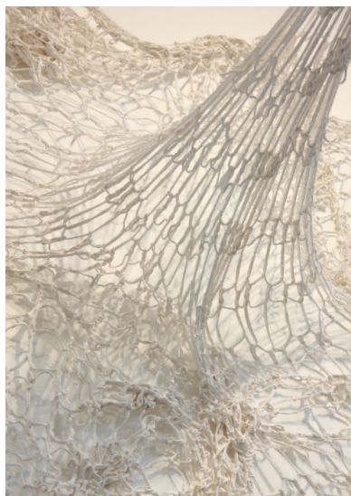
Isobel Finlay, Vortex (detail) 2020, plaster and synthetic fibres